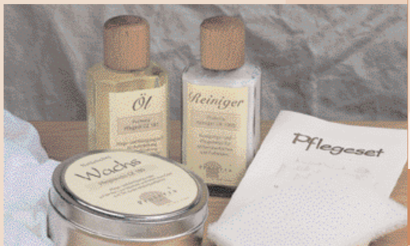
Proterra Care set XPR